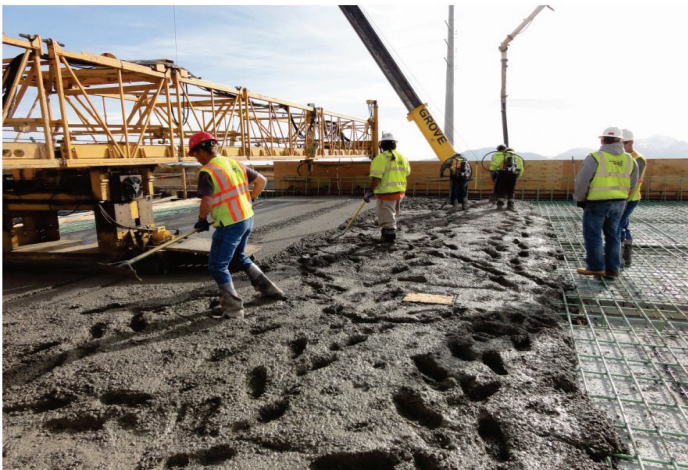
Concrete placement around deck sensor

Researchers at Brigham Young University are evaluating the performance of these decks with UDOT by 1) monitoring in-situ bridge deck properties such as moisture and diffusivity with sensors embedded in the decks, 2) comparing deck performance in terms of early-age cracking with distress surveys, and 3) evaluating the field-cast concrete mixtures in the laboratory in terms of compressive strength and chloride permeability.